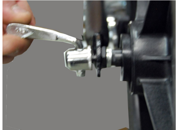
Quick Release Lever

In order to install the swivel wheels first you must remove the standard front wheel by unfolding the quick release lever and sliding the wheel out of the fork tips.